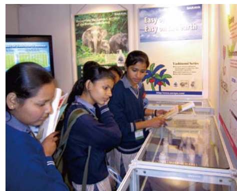
Indian high school students visiting the booth of Saraya Co. Ltd.