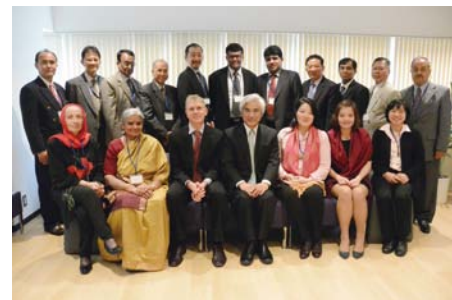
Participants in the SNAP coordination meeting.