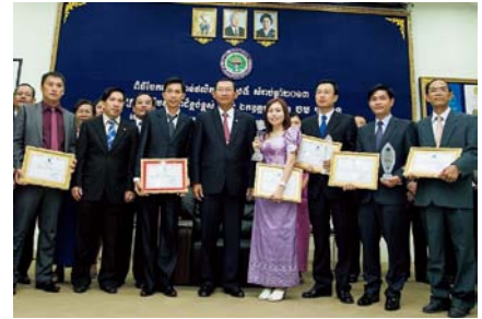
Representatives of 5S award competitors gather for a commemorative photo with Senior Minister Dr. Cham Prasidh.