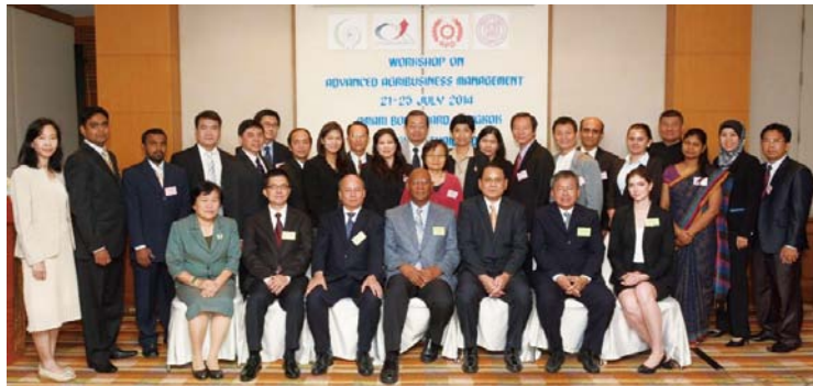
Experts and participants in the workshop on Advanced Agribusiness Management.