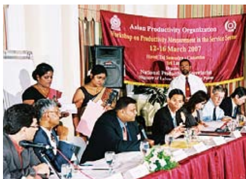
Workshop in session

In addition to the publication of the Productivity Data and Analysis series and creating a database, the APO is also involved in sectoral productivity measurement in specific industry sectors. A workshop on Productivity Measurement in the Service Sector was held in Colombo, Sri Lanka, 12–15 March. The objectives were to identify the priority subsectors in participating member countries; clarify the concepts of outputs and inputs such as capital and labor and how they are measured; identify problems in their measurement; propose key recommendations to address problems in measurement; and ensure that, at the enterprise level, measurement supports productivity improvement.