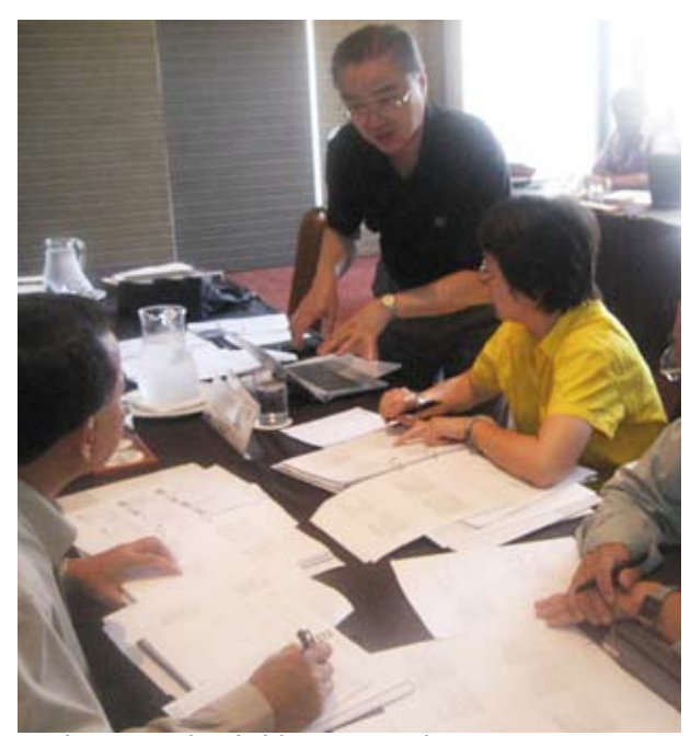
Developing research methodology at Fiji coordination meeting

detailed need-assessment survey of NPOs is presently underway as part of DON Strategy. The results will be used in a future strategic capacity-building program for NPOs. As part of the survey, two coordination meetings were convened in Cambodia, 26-27 April, and in Fiji, 8-9 August. Fifteen member countries are at present participating in this survey. For expediency, they have been grouped into two clusters and are guided by two chief experts each to facilitate communications and guidance. The coordination meetings were held to finalize the common methodology for collecting baseline data on NPOs and member countries. Ideas and suggestions both from national experts and chief experts as well as the Secretariat were advanced, and a consensus was reached on a common approach and methodology for the survey, as well as on the format for the report.