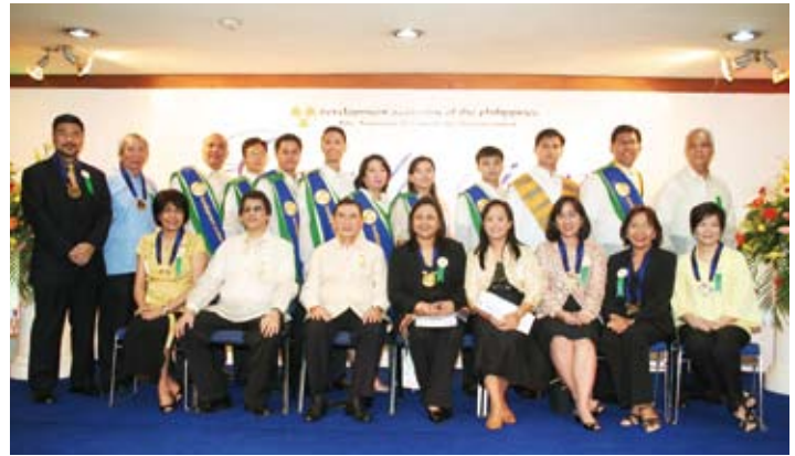
First graduates of the MPQM Program along with faculty members