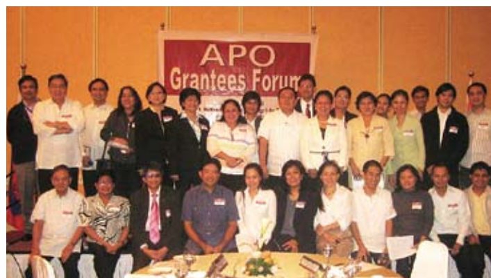
Participants and DAP staff at the APO Grantees' Forum in Manila