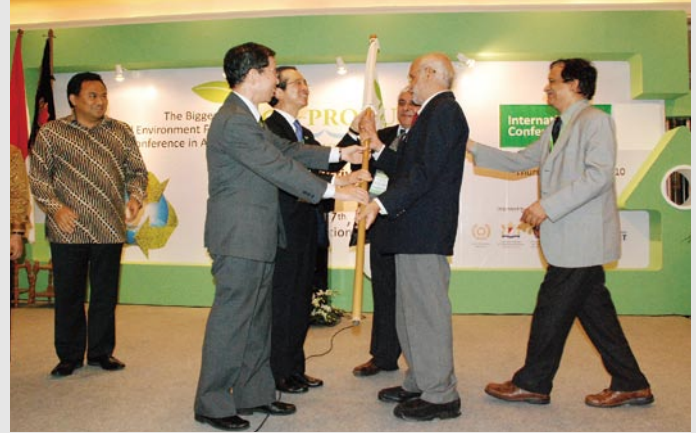
EPIF flag handed over to representatives of India, the EPIF 2011 host country

mental Affairs for the Ministry of Economy, Trade and Industry Jun Arima; deputy ministers from Indonesian divisions and bureaus; and representatives from Indonesian ministries of Forestry and the Environment. The discussion explored low-carbon growth and the global economy; green supply chains and green procurement; and 3R policies and programs. Other topics, such as eco-finance, eco-business, and climate change were also covered by speakers from financial groups. The two-day forum was packed with some 300 international and local audience members who enthusiastically participated in each session with insightful observations and questions.