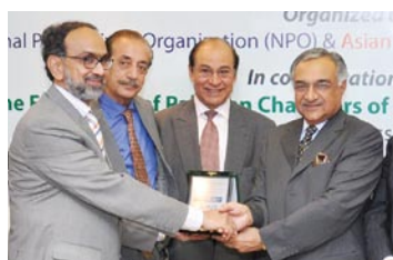
p. 8, Conference, Pakistan