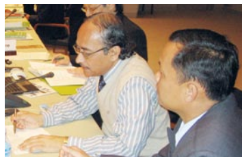
p. 6, Forum, Japan