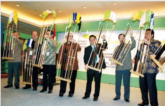
Batik-clad guests of honor shaking angklung, a traditional Indonesian musical instrument, to open the EPIF 2010