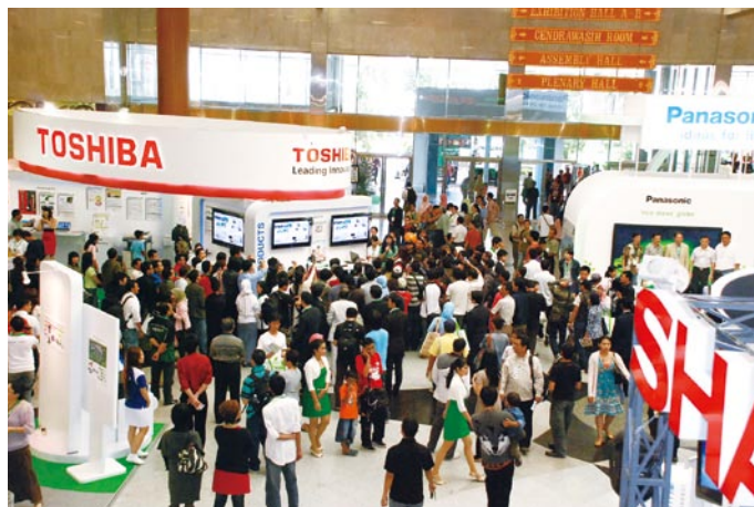
Eager crowd in the main BSJCC lobby

T he APO completed its four-day Eco-products International Fair (EPIF), Asia's largest international exhibition of advanced eco-technology, -products, and -services, with new records set for the most exhibitors and largest exhibition area. The EPIF 2010, the sixth in the series, was held at the Balai Sidang Jakarta Convention Center (BSJCC) in Indonesia, 4-7 March, with the theme Green Productivity to Enhance Competitiveness. It was jointly organized in close collaboration by the APO, Indonesian Chamber of Commerce and Industry (KADIN), and Indonesian Ministry of Manpower and Transmigration. With the enthusiastic support of the host country, a total of 90,004 visitors came to the fair, the second largest number on record.