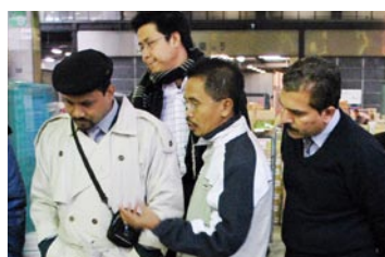
p. 6, Study mission, Japan