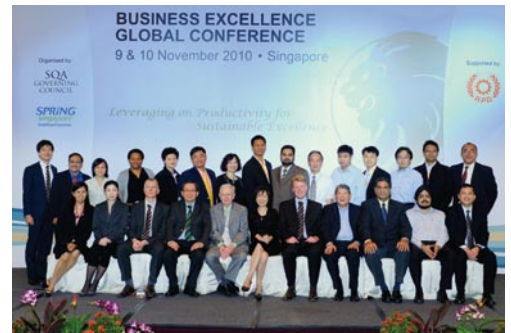
Senior assessors and experts at the training workshop on BE.