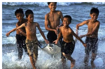
p. 8, APO Photo Contest winners