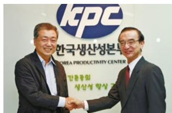
p. 7, SG trip, ROK