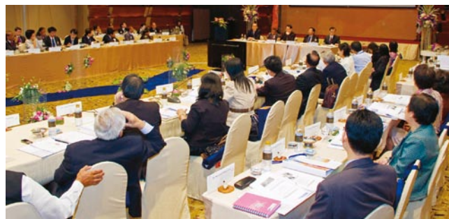
Inaugural session of the 51st Workshop Meeting of Heads of NPOs in Bangkok, 19 October 2010.

T hirty-five NPO and Agriculture delegates from the 19 APO member countries gathered in Bangkok, the dynamic capital of the Kingdom of Thailand, for the 51st Workshop Meeting (WSM) of Heads of National Productivity Organization (NPOs), 19–21 October 2010. Accompanying the delegates were 17 advisers from nine member countries, and there were also four observers representing the United Nations Food and Agriculture Organization Regional Office for Asia and Pacific, Pan African Productivity Association, United Nations Conference on Trade and Development, and United Nations Economic and Social Commission for Asia and the Pacific.