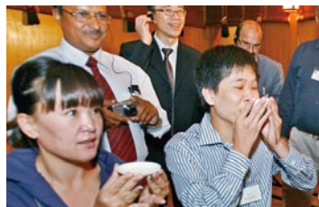
p. 6, Training course, Japan