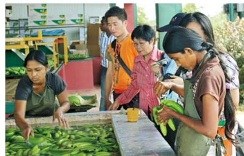
Participants observe the cleaning of newly harvested bananas during a "banana tour" offered as part of the agrotourism project of Pelwehera CIC Farm 14 August 2010.