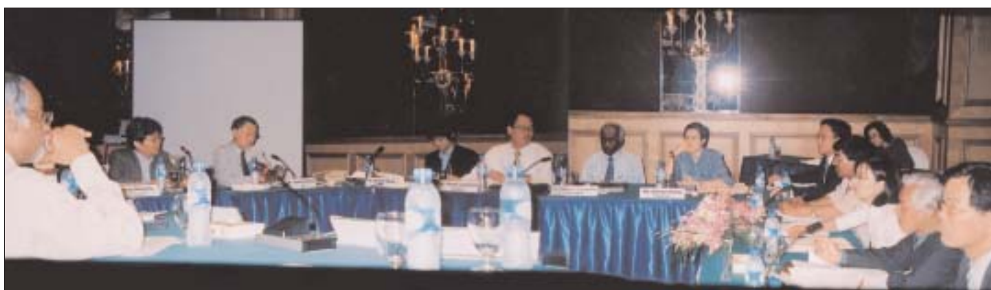
Experts' meeting in progress