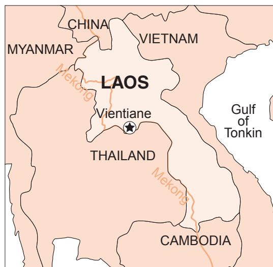
Map of Laos

On 18 June 2002, the Lao People's Democratic Republic (Laos) became the 19th and newest member of the APO. Laos' application to join the APO was approved by the APO Governing Body at its recent meeting in Kuala Lumpur, Malaysia, 18-20 June 2002. As a member of the APO, Laos joins the ranks of Bangladesh, Republic of China, Fiji, Hong Kong, India, Indonesia, Islamic Republic of Iran, Japan, Republic of Korea, Malaysia, Mongolia, Nepal, Pakistan, Philippines, Singapore, Sri Lanka, Thailand, and Vietnam in proclaiming productivity enhancement as a key strategy in socio-economic development and in improving the quality of life of their people.