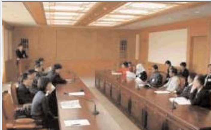
Participants (R) being briefed by KIST officials