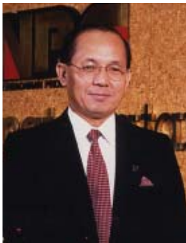
Tan Sri Dato' Azman Hashim