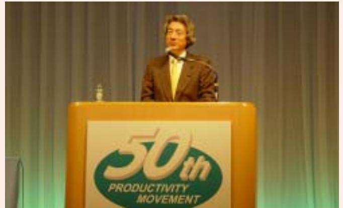
Prime Minister Koizumi addressing the symposium