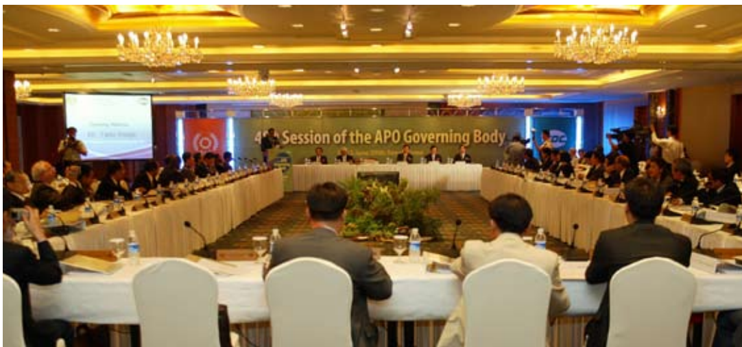
Inaugural Session of the Governing Body Meeting