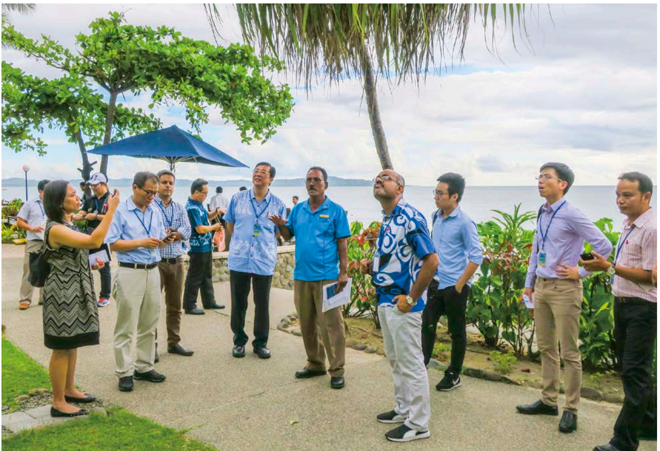
Participants visiting the Radisson Blu Resort to observe GP initiatives and good practices.